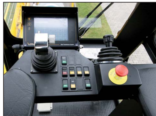
Touch screen mounted in spraying cabin.